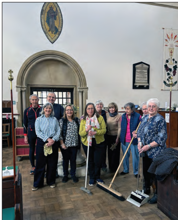
The church is cleaned and tidied every Friday by volunteers

We have a thriving Saturday Market once a month in the church. This promotes a point of contact with the local community, attracting artists and craftspeople selling their wares, while from within the congregation there are stalls selling home baking, bric-a-brac and second-hand books, as well as lunches and teas. This is a very popular enterprise and regularly contributes around £1,500 to church finances.