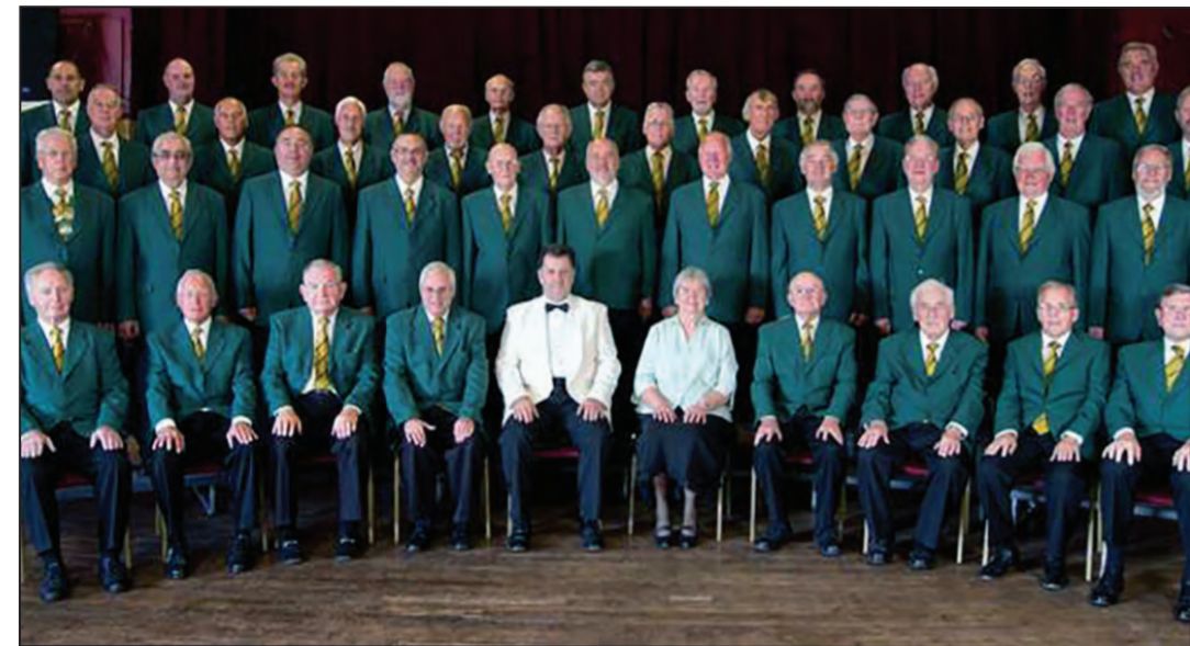
The Thanet Male Male Voice Choir