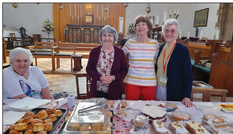
One of the highlights of the Monthly Market : cakes!

During the year many social activities take place, including a Harvest Supper, Christmas and Summer Markets, a Christian Aid lunch, and various other social evenings that include both members of the congregation and those from the wider community.